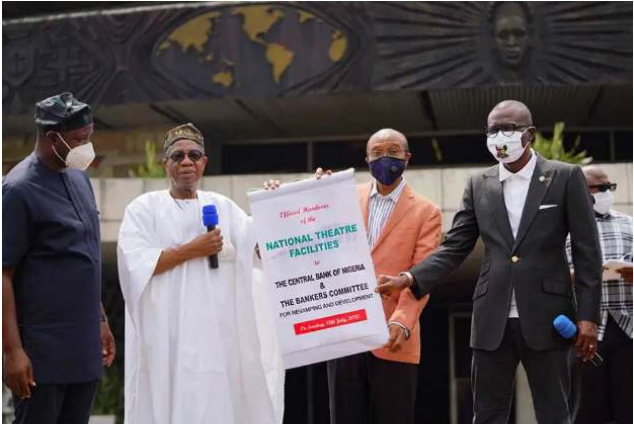
(L-R) Minister of Information and Communication, Lai Mohammed, CBN Governor Godwin Emefiele and the Lagos State Governor, Babajide Sanwolu during the Handover Ceremony of the National Arts Theatre, Iganmu, Lagos

The Governor of the Central Bank of Nigeria (CBN), Mr Godwin Emefiele, on Sunday, February 14, 2021, said that no fewer than 25,000 people would be gainfully employed at the National Arts Theatre when completed.