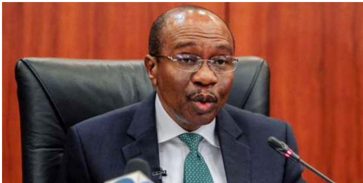
CBN Governor, Mr. Godwin Emefiele speaking at the event

The Governor, Central Bank of Nigeria (CBN) Mr. Godwin Emefiele has noted that the initiatives introduced by the CBN to boost forex in the country were yielding results as weekly diaspora remittances has risen from $5m to $30m.