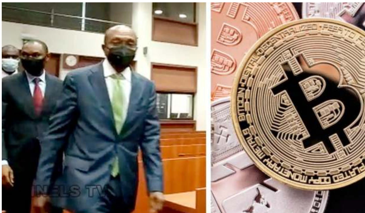
CBN Governor, Mr. Godwin Emefiele arriving the National Assembly for the briefing

T he Governor, Central Bank of Nigeria (CBN), Mr. Godwin Emefiele says the Bank's decision to prohibit deposit money banks, non-banking institutions and Other Financial Institutions from facilitating trading and dealings in cryptocurrency is in the best interest of Nigerian depositors and the country's financial system.