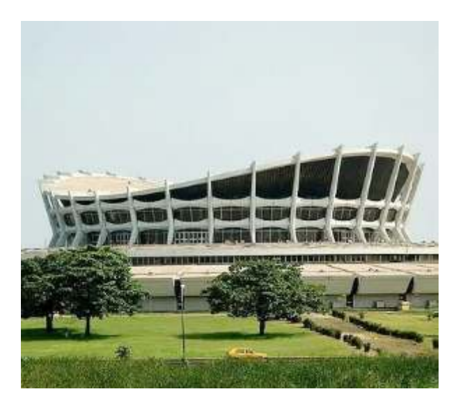
Theatre. He added that the Bankers' Committee would provide funding for the prototype cluster labeled the "Signature Cluster".

The "Signature Cluster" which would consist of a building each for music, film, fashion and information technology verticals, would also consist of a Visitors' Welcome Centre; police and fire stations; and a structured parking lot for up to 500 vehicles would be built.