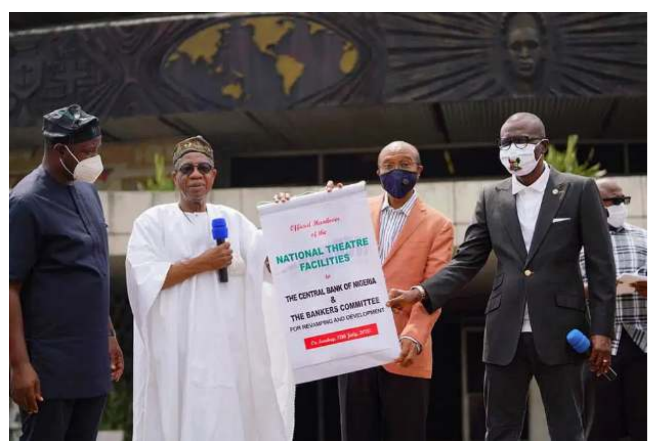
(L-R) Minister of Information and Communication, Lai Mohammed, CBN Governor Godwin Emefiele and the Lagos State Governor, Babajide Sanwolu during the Handover Ceremony of the National Arts Theatre, Iganmu,Lagos

he Governor of the Central Bank of Nigeria (CBN), Mr Godwin Emefiele, on Sunday, February 14, 2021, said that no fewer than 25,000 people would be gainfully employed at the National Arts Theatre when completed.