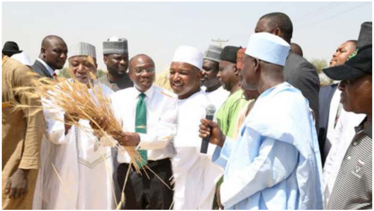
CBN Governor, Mr. Godwin Emefiele, supported by other dignitaries during the rice harvest in Kebbi State

he Governor, Central Bank of Nigeria (CBN), Mr. Godwin Emefiele has underscored the need for all stakeholders to sustain current efforts championed by the Bank to galvanize agricultural production towards meeting the requirements of Nigeria's growing population.