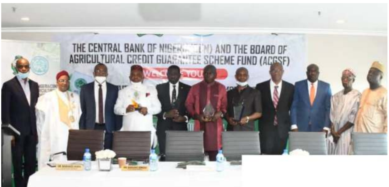
Officials of CBN, ACGSF and Awardees in a group photograph

agricultural sector with the aim of increasing the level of bank credit to the agricultural sector.