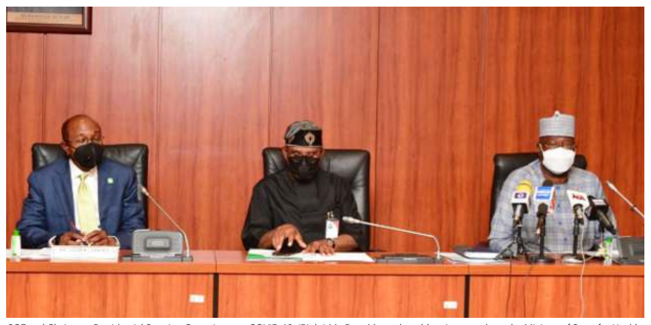
SGF and Chairman, Presidential Steering Committee on COVID-19, (Right) Mr. Boss Mustapha addressing awardees, the Minister of State for Health, Senator Olorunnimbe Mamora (middle) and the Governor, Central Bank of Nigeria (CBN), Mr. Godwin Emefiele listen

he Governor, Central Bank of Nigeria (CBN), Mr. Godwin Emefiele says that a vibrant and innovative healthcare system is vital for the country's national security, hence the need to encourage research and innovation in the treatment of health conditions for the Nigerian citizens.