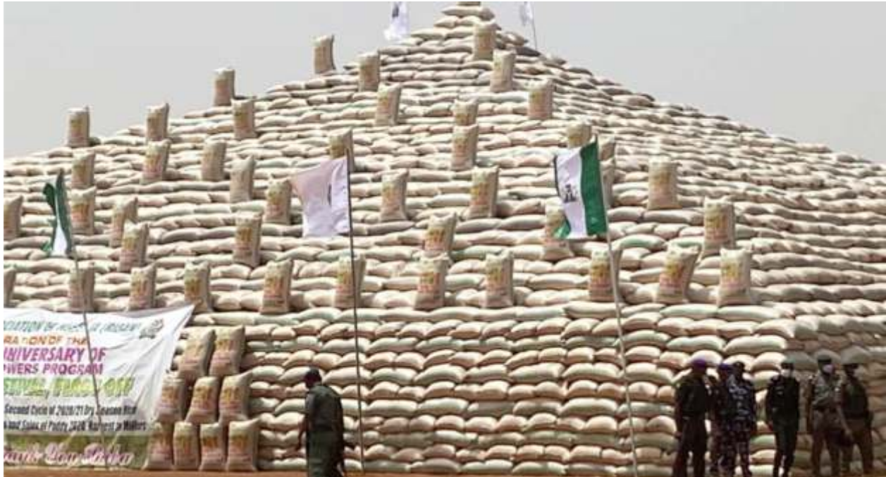
Anchor Borrowers' Programme Creates Grain Pyramids Across the Country

The Anchor Borrowers' Programme (ABP) initiated by Mr. Godwin Emefiele barely a year into his tenure as the Governor of the Central Bank of Nigeria in 2015, was audacious move. A programme of necessity one would say, due to the dwindling revenue from oil, Nigeria's monolithic product, and mainstay of the economy. Intellectually conceived, it was borne out of stark reality that though Nigeria is blessed with what it can produce and eat, yet, the country was strapped to warped foreign taste, exporting jobs, and ultimately, draining the country's reserves.