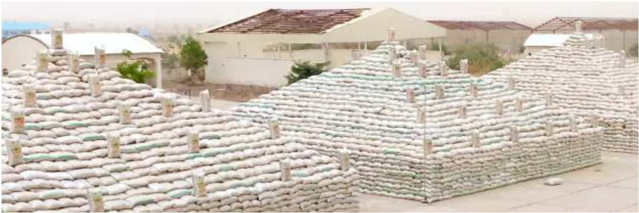
Some of Grain Pyramids as a fall-out of the ABP

local farming, and production of rice, there would have been a major food crisis when most nations in the wake of the outbreak of COVID-19 pandemic, shut their borders, and banned export, especially rice producing Asian countries. Indeed, the ABP programme proved to be a timely lifesaver.