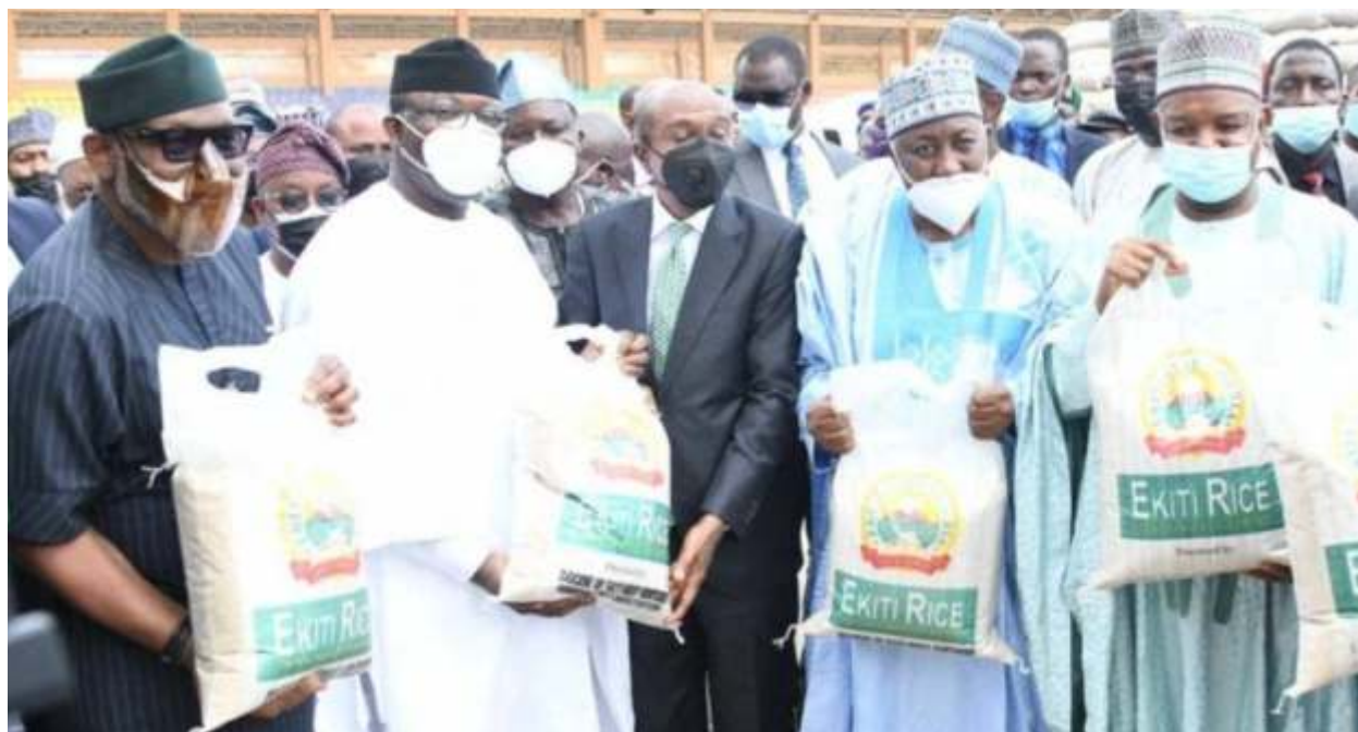
CBN Governor, Mr. Godwin Emefiele (centre) flanked from left to right by Rotimi Akeredolu and Kayode Fayemi, Governors of Ondo and Ekiti States, and Mohammed Badaru and Abubakar Bagudu, Governors of Jigawa and Kebbi States

T he Governor, Central Bank of Nigeria (CBN), Mr. Godwin Emefiele, has faulted claims in certain quarters suggesting that the Bank's targeted interventions in the agricultural sector are tilted in favour of a certain section of the country.