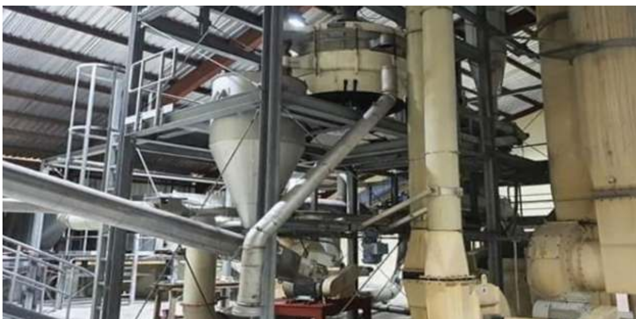
Part of the Rivers Cassava Processing Plant

He also noted that as part of his Ministry's drive to encourage bakers to embrace import substitution of wheat and flour, there would be an increased drive to incorporate cassava flour in their baking activities as the cassava processing plant was capable of meeting their needs.