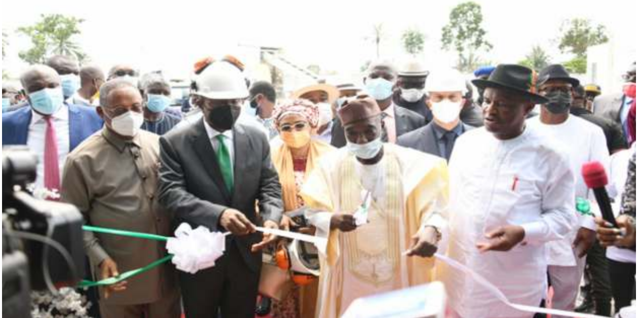
Rivers Cassava Processing Company being Commissioned

T he Governor of the Central Bank of Nigeria (CBN), Mr. Godwin Emefiele has urged State Governors to invest in critical sectors of the economy such as agriculture and manufacturing, given the multiplier effect on growth, employment, and wealth creation.