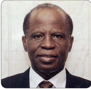
Chief (Dr.) J. O. Sanusi, (CON)

I t is my honour and privilege to welcome you all to this year's Policy Seminar on the 2004 Federal Government Budget, jointly organized by the Central Bank of Nigeria (CBN), the National Centre for Economic Management and Administration (NCEMA) and the Nigerian Economic Society (NES). This seminar is the ninth in the series of the inter-agency collaborative effort, aimed at providing a forum for major stakeholders in the economy to critically analyse and evaluate the adequacy or otherwise of the current fiscal and monetary policy measures, in achieving the central objectives of the Federal Government.