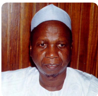
Allhaji (Dr.) Mahmud Yayale Ahmed